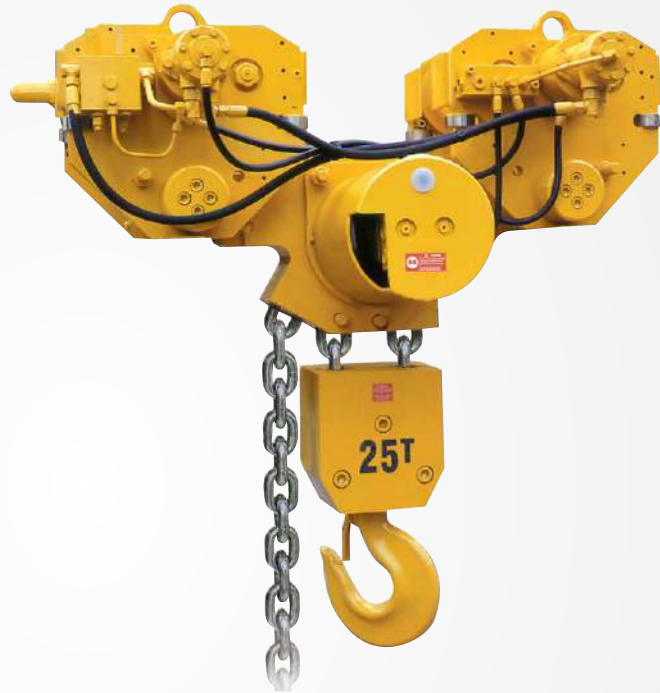
Standard Trolley Mounted