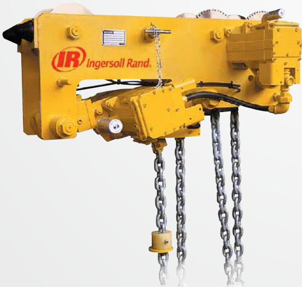
Low Headroom Trolley