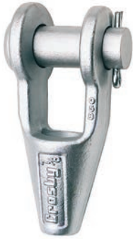
G-416 / S-416

Open Grooved Sockets meet the performance requirements of Federal Specification RR-S-550E, Type A, except for those provisions required of the contractor. For additional information, see page 452.