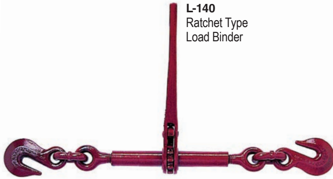
L-140 Ratchet Type Load Binder