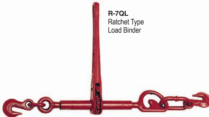
R-7QL Ratchet Type Load Binder