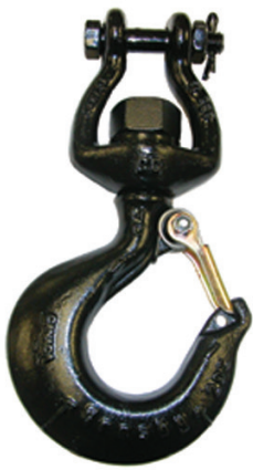
S-3316 REPLACEMENT HOOK