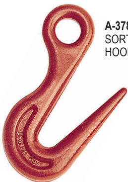
A-378 SORTING HOOK