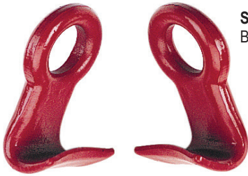
S-377 BARREL HOOKS