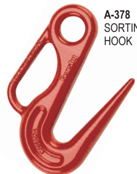
A-378 SORTING HOOK