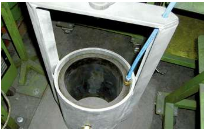
Pipe gripper with internal expansion

We implement your tool idea: Especially in the industrial sector, special tools tailored to individual needs are often required. This is where our special and custom-made products come in: Together with our customers, we develop and manufacture pneumatic constructions for every application. Flexibility and versatility are the top priorities: Whether material, operating pressure, size, shape, filling connection or resistance – our customers can choose from many different options, have a say themselves and create their desired tool together with our experts.