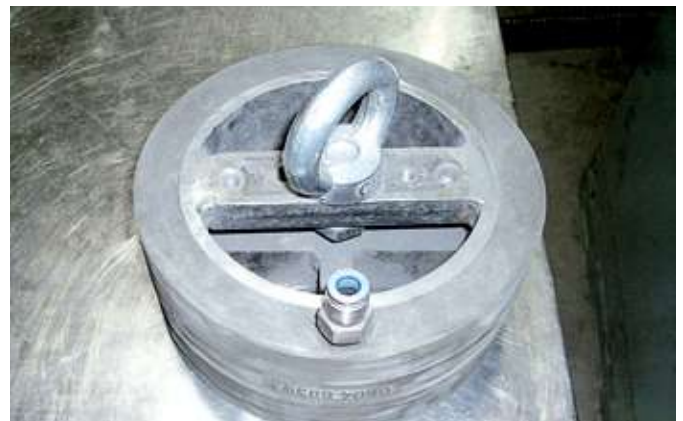
Pipe gripper with external expansion