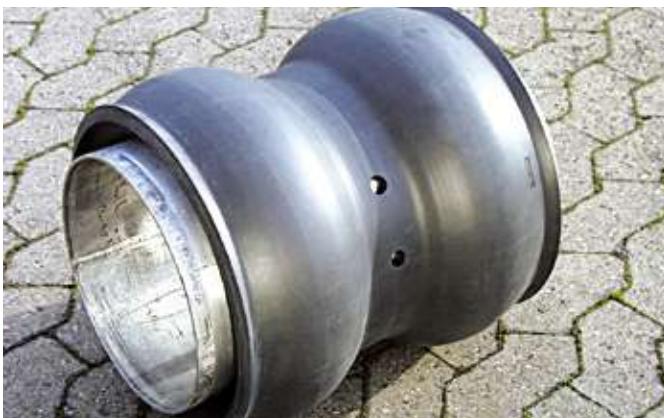
Gel packer with constriction