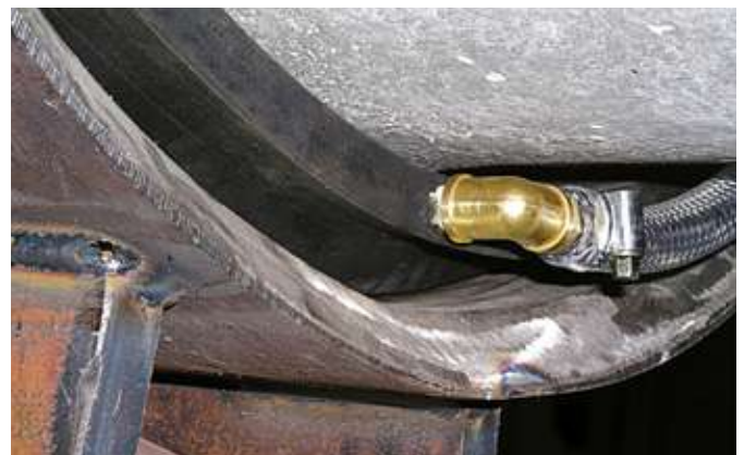
Testing device Pipe jacking